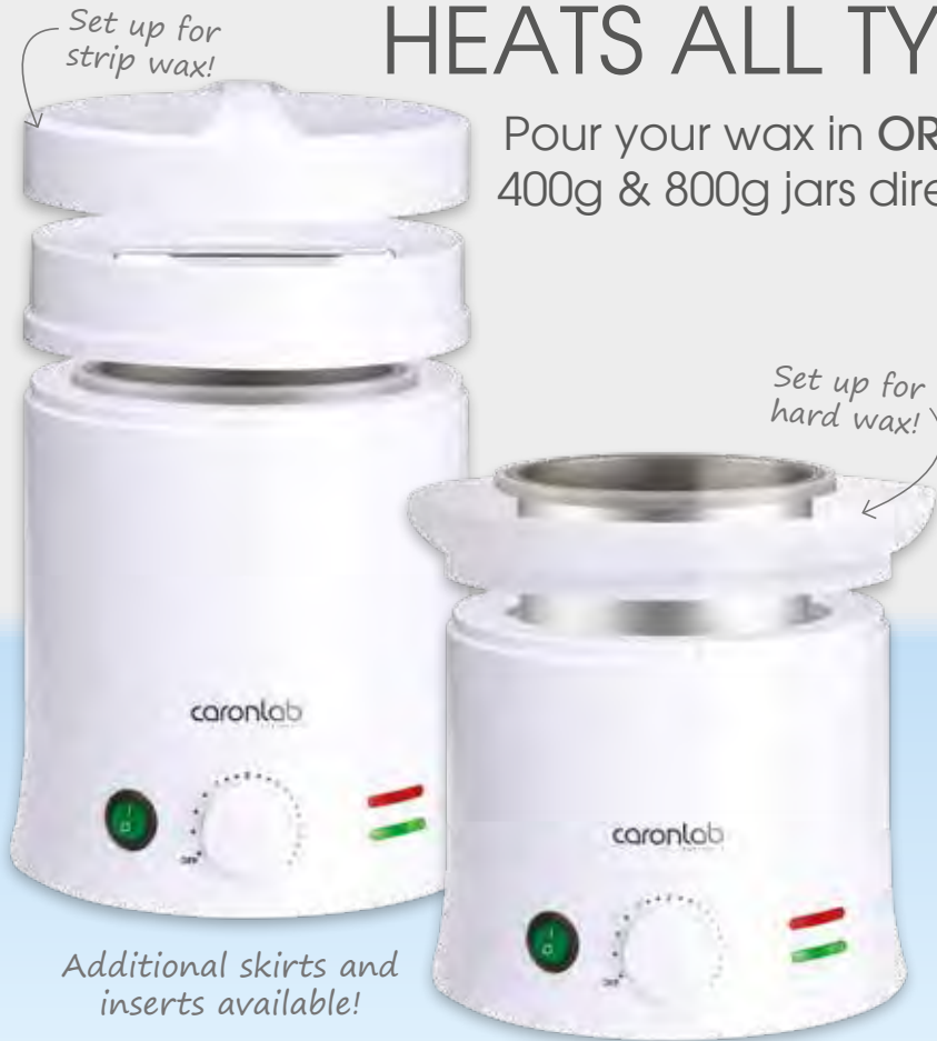
Additional skirts and inserts available!

Pour your wax in OR place our microwavable 400g & 800g jars directly into the metal insert!*